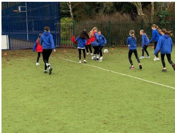
15 - In the week of 4th Feb to 9th we joined in with the rest of the country celebrating football in schools week where boys and girls from KS2 took time out of class to play football matches.