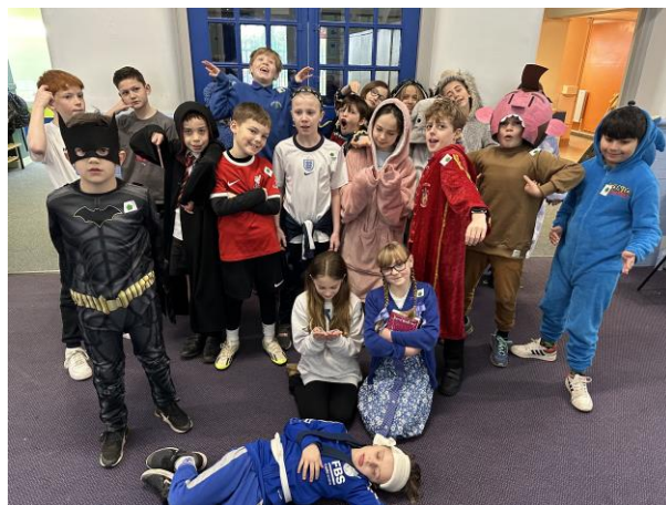
8 - World Book Day 2024