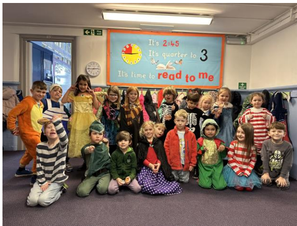
14 - World Book Day 2024