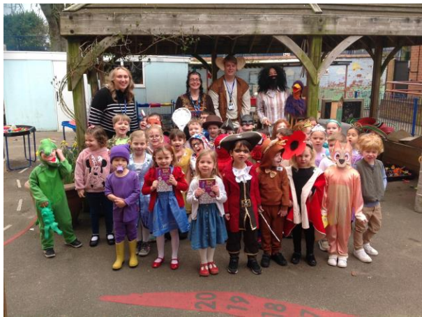
12 - World Book Day 2024