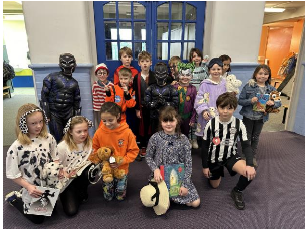
10 - World Book Day 2024