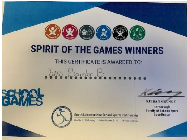
20 - One of our Yr 5/6 Dodgeball teams picking up Spirit of the Games Award!