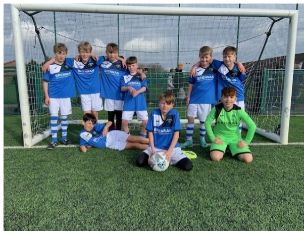
17 - On 5th March, the Mixed Football teams wrapped up their season at Harborough Town FC with 3 teams competing strongly with other local schools across Market Harborough.