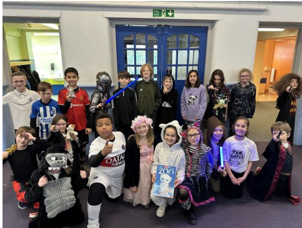
13 - World Book Day 2024