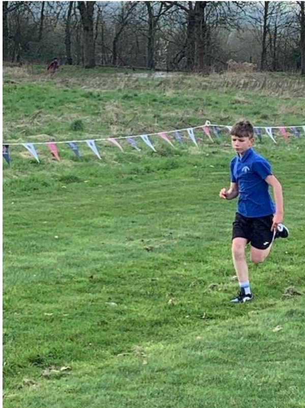
18 - On Wednesday 6th March, we were invited to Stoneygate School to take part in a Cross Country event where some of our Year 5 & 6 runners did brilliantly, including a top 5 finish for one of our Year 6 students! Well done to all that took part! A big thank you to the parents who were able to assist on the day!!