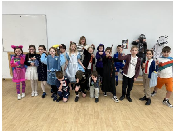
6 - World Book Day 2024