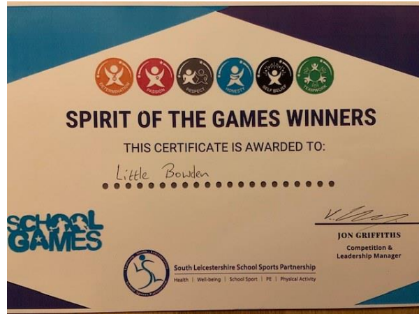
21 - Our Yr 3/4 Dodgeball team also collected Spirit of the Games Award in their event!