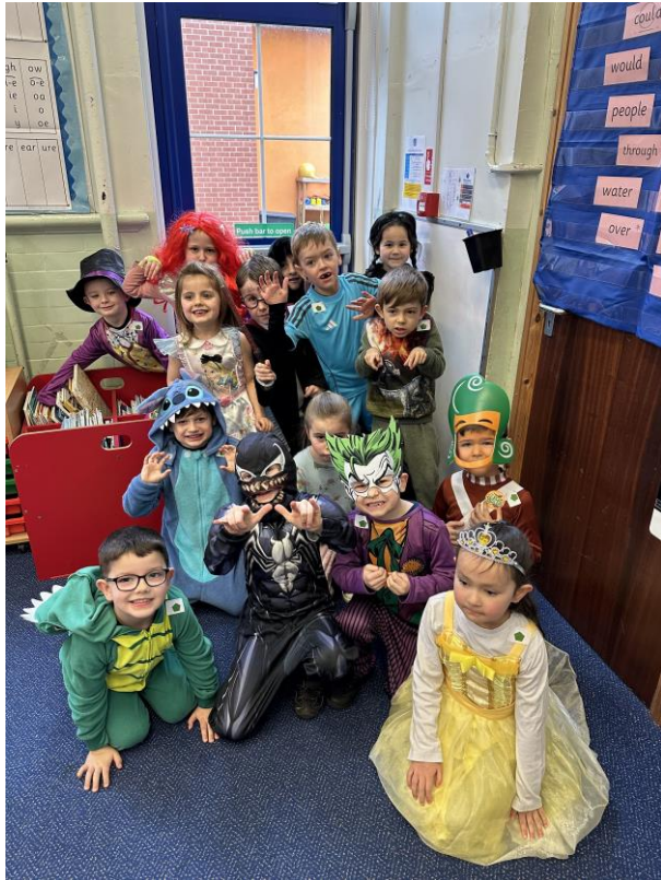
9 - World Book Day 2024