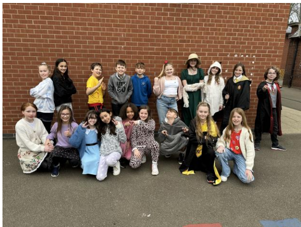
11 - World Book Day 2024