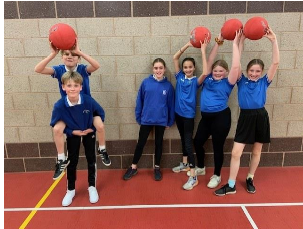
16 - On the 27th February we had 2 Year 5 & 6 teams competing in a Dodgeball Tournament at RSA.