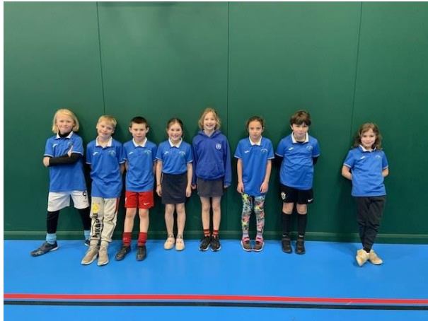
19 - Thursday 7th March at Welland Park Academy, the Year 3 & 4 students were involved in a Dodgeball event of their own and were absolutely brilliant!! . Some superstar dodgeball players in the making!!