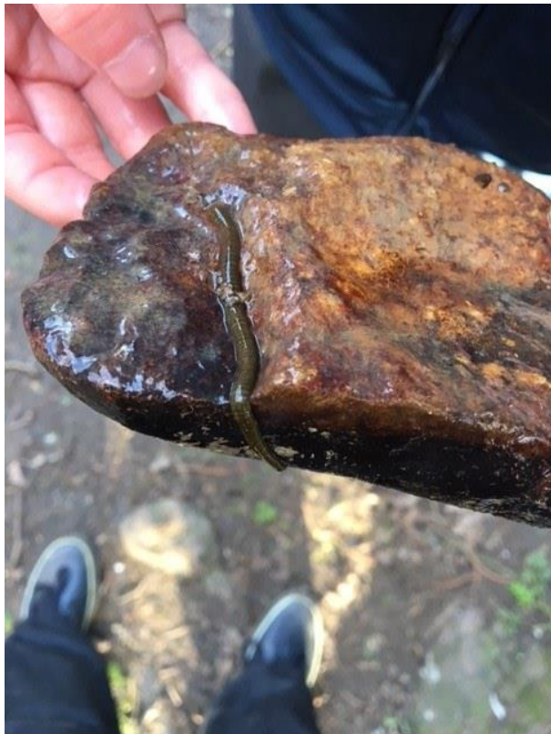
17 - They even found a leech!