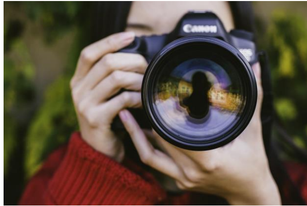
Photo permissions - Please help

Reminder -If you haven't already done so, please log into Arbor and update your photo permissions. We always love to shout about all the amazing things that happen at school but we can't always share the photos. If you're having problems, please email the office and we'll be happy to update them for you.