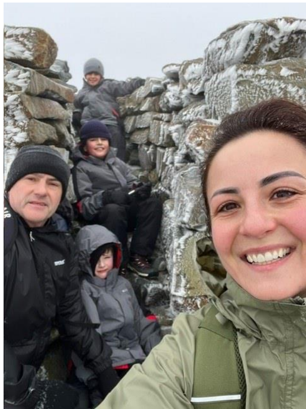
2 - High achieving climb for charity!

Reminder -If you haven't already done so, please log into Arbor and update your photo permissions. We always love to shout about all the amazing things that happen at school but we can't always share the photos. If you're having problems, please email the office and we'll be happy to update them for you.