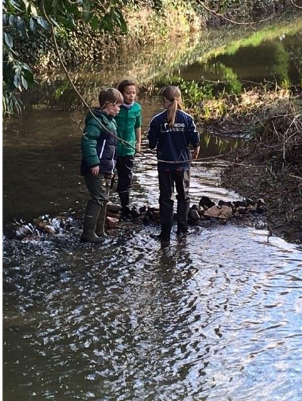
16 - The year 5's started making a dam in the river