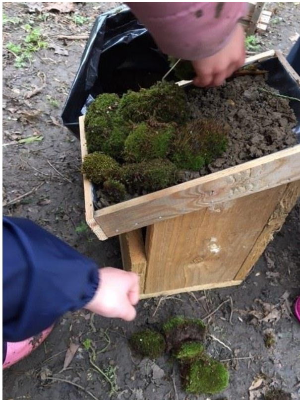
7 - We also put up some bird boxes with the hope some Robins or Wrens will move in this spring.