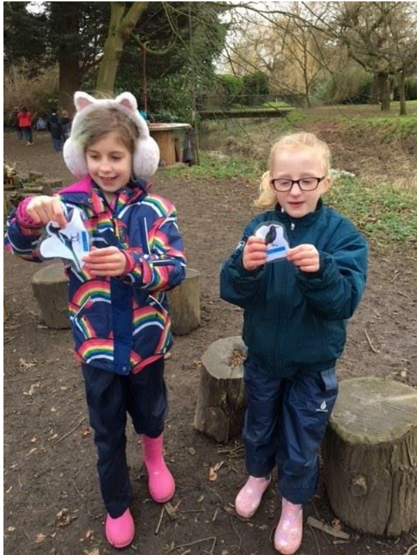
8 - Can you spot these birds in nature? How many birds do you know?