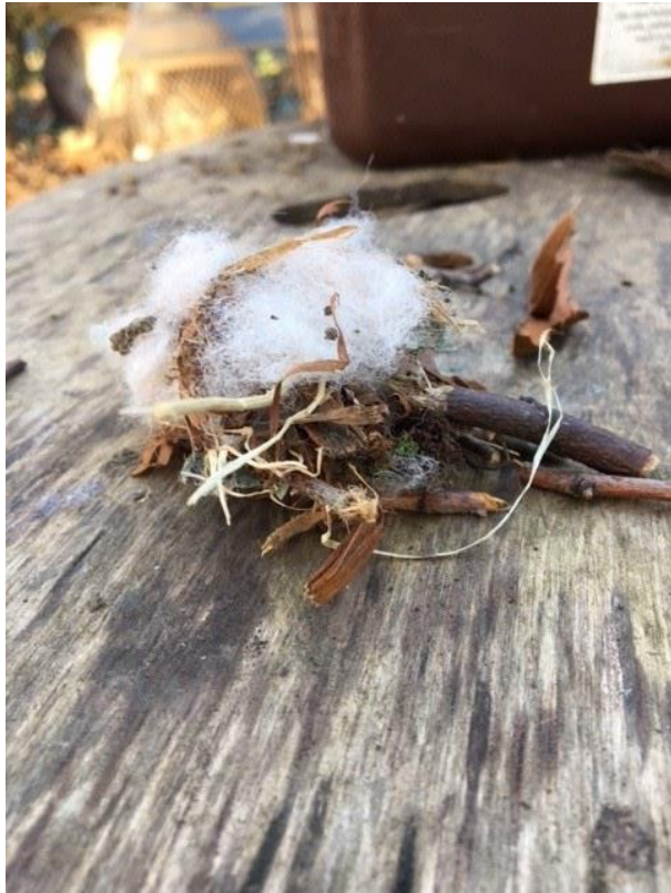
6 - It was a tricky task.