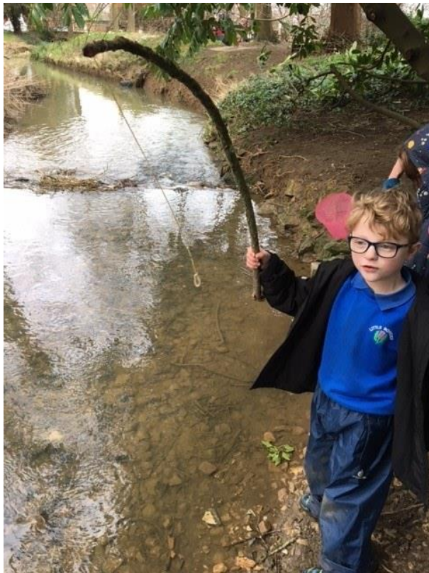
15 - Lots of fishing was taking place