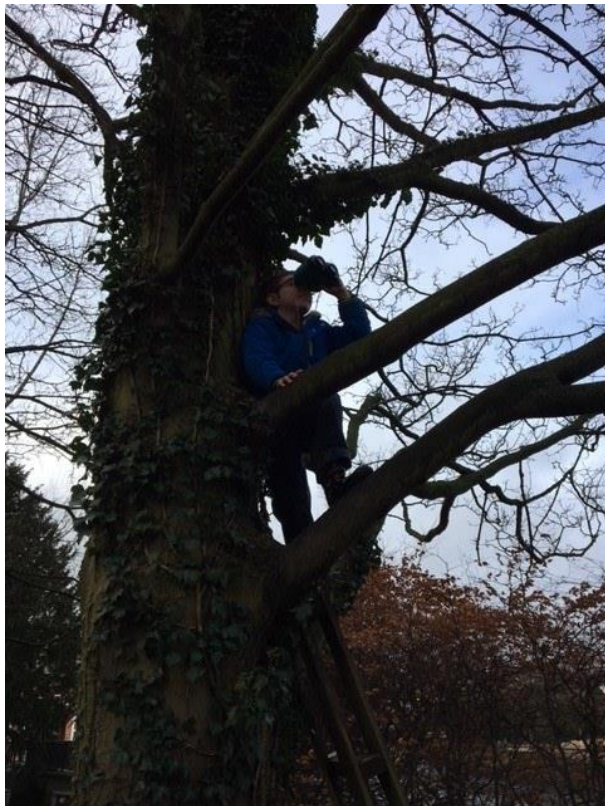
11 - Looking for birds