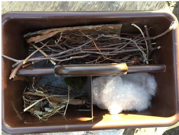
4 - The children at Forest School have been learning about birds and what they use to make nests.