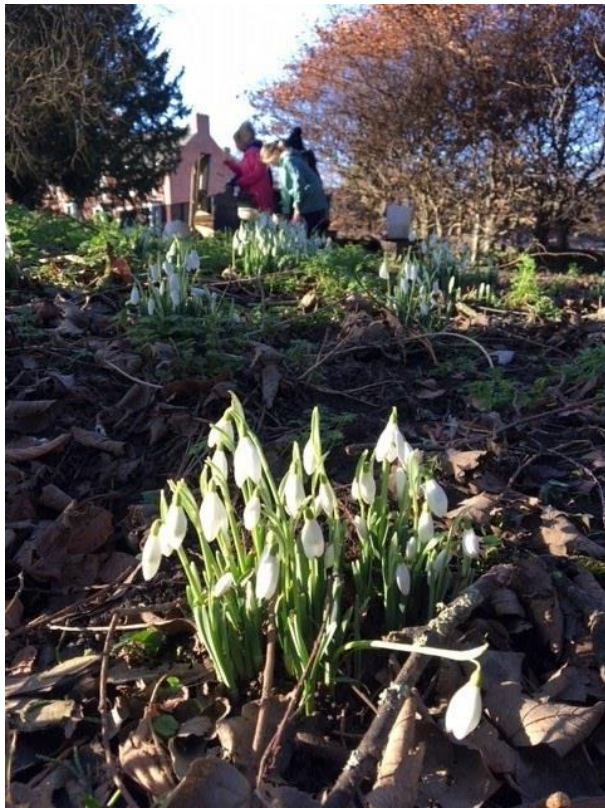
14 - The snow drops have come up....not long till spring!