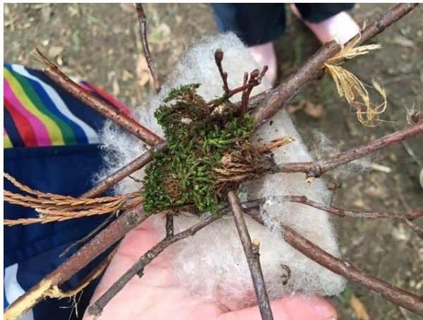
5 - Then they tried to make their own.