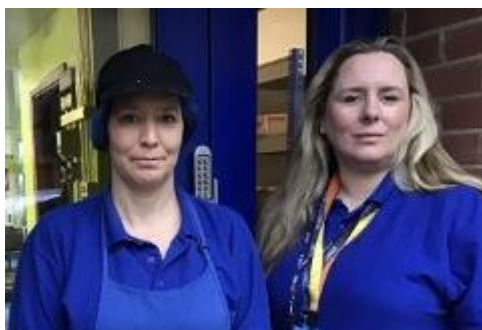
1 - 5 Star Rating from 5 Star Kitchen!

The second Coffee Morning of the year took place on Wednesday. We discussed a range of changes that have taken place at school and took feedback on further changes to look at before doing a tour of the school to see the changes up close. Thank you to those parents who came to listen and share your views. There will be another Coffee Morning in the Summer term and I hope you will join me then.