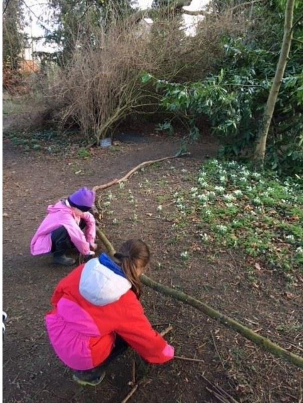
13 - Some of the children took protecting the snowdrops into their hands and made a border.