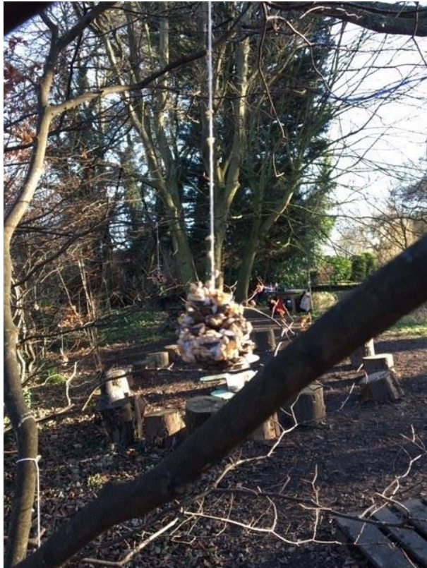
10 - The bird feeders were a success and even fed some hungry squirrels when the seed was all gone.