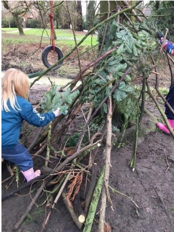
12 - With all the talk about birds nesting we decided to make our own shelters.