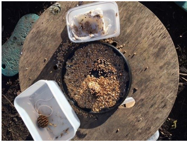
9 - The children wanted to help the winter hungry birds, so we made bird feeders.